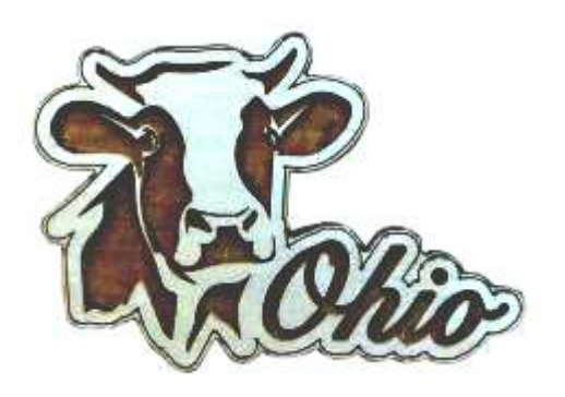
11147 Cow Magnet