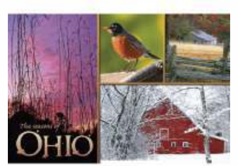
11095 4 Seasons Photo Magnet