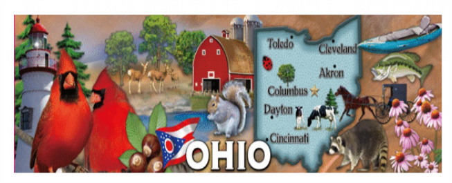
11275 Inside/Outside Photo Magnet