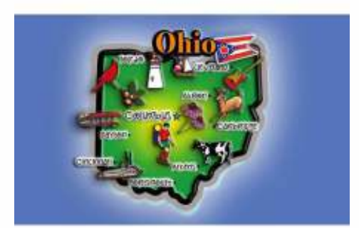
11268 Map Facts Photo Magnet