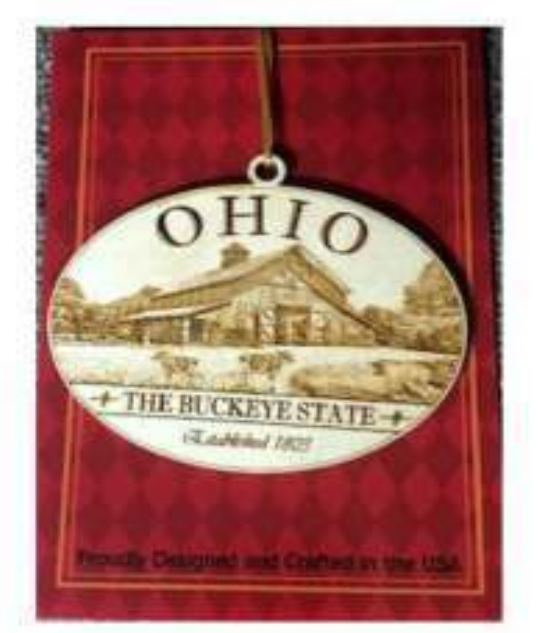
22003 Wood Farm Scene Ornament Packaged for Hanging