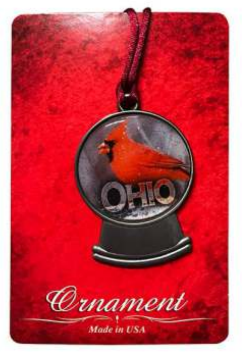
22027 Snowglobe Ornament Packaged for Hanging