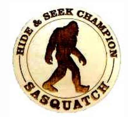
11282 Hide & Seek Magnet