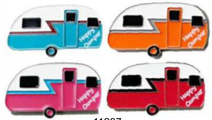
11287 Happy Camper Magnet 4 Color assort