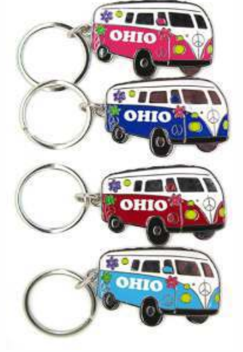
12212 Groovy Van Keychain 4 Color assort