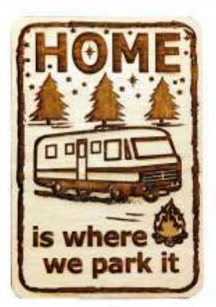
11167 Trailer Magnet