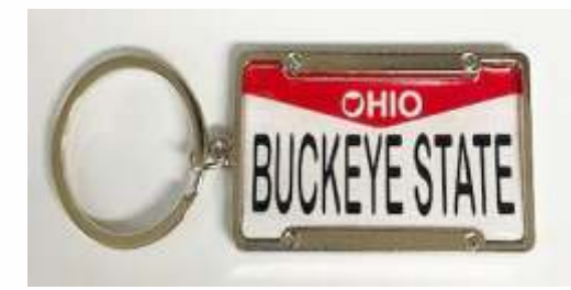
License plate kc & Matching Magnet