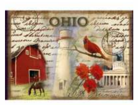
N3360 Postage Photo Magnet