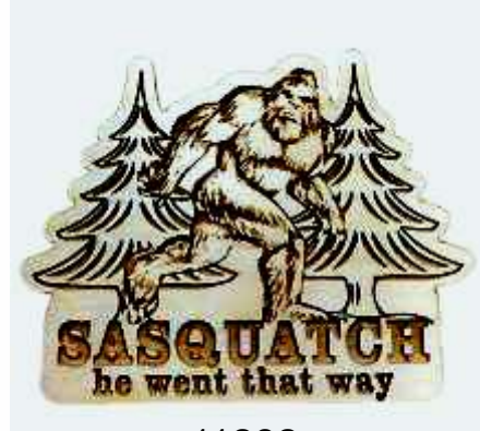
11282 Sasquatch That Way Magnet