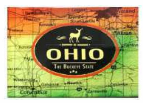
11262 Roadmap Photo Magnet