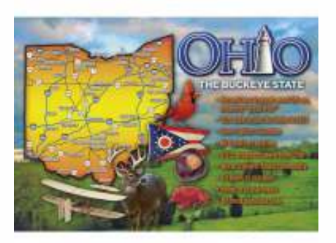
11096 Map Facts Photo Magnet