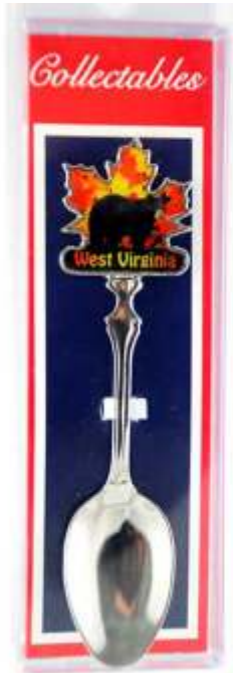
20021 Photo Spoon