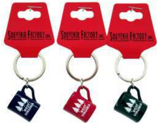
12220 Colorful Cup Keychain