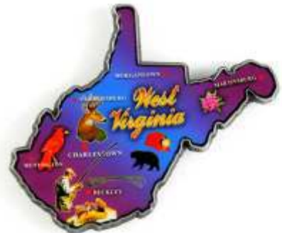
11101 Map Collage Magnet