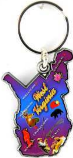
12058 Map Collage Keychain