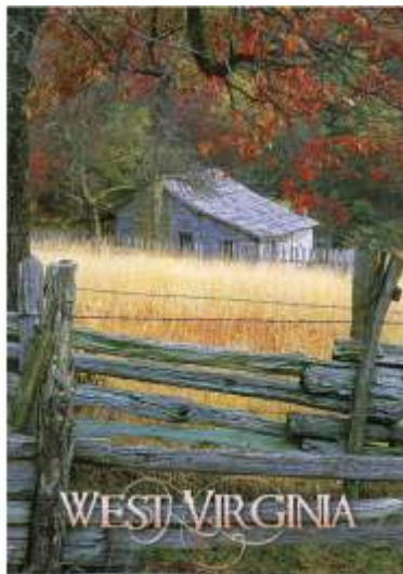
11254 Red October Magnet