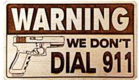
11163 911 Magnet