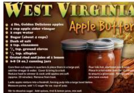
11251 Apple Butter Magnet