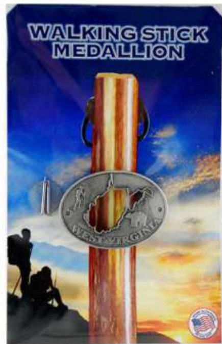
20020 Walking Stick Medallion Packaged for Hanging