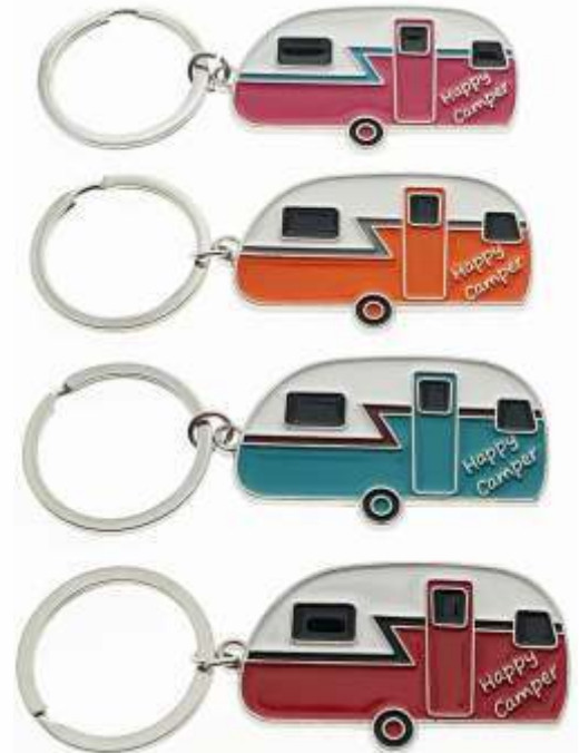
12226 Happy Camper Keychain