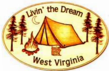
11129 Camping Magnet