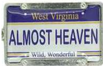
11239 License Plate Magnet