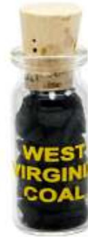
34004 Coal in a Bottle