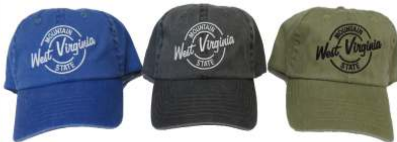
18029 Mountain State Hat