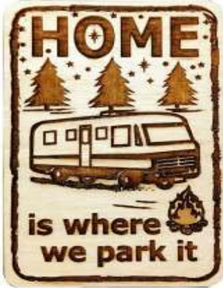
11167 Trailer Magnet