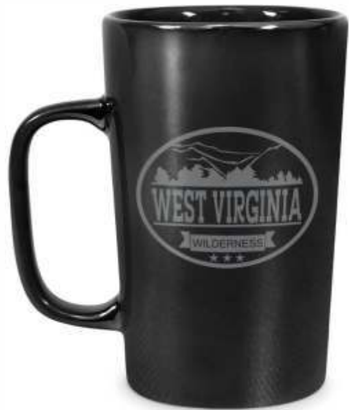
13114 Wilderness Mug