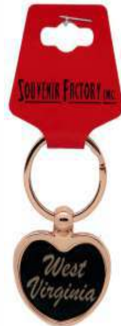
12219 Rose Gold Keychain