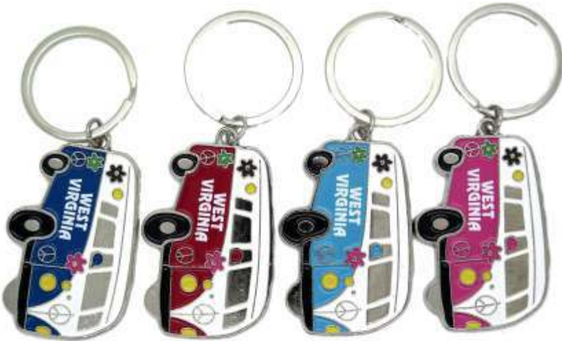
12218 Groovy Van Keychain