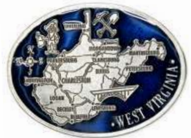
11130 Pewter Oval Magnet