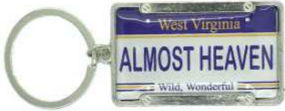
12225 License Plate Keychain