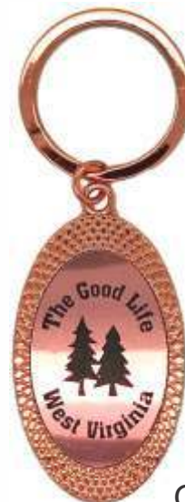
12223 Rose Gold Oval Keychain