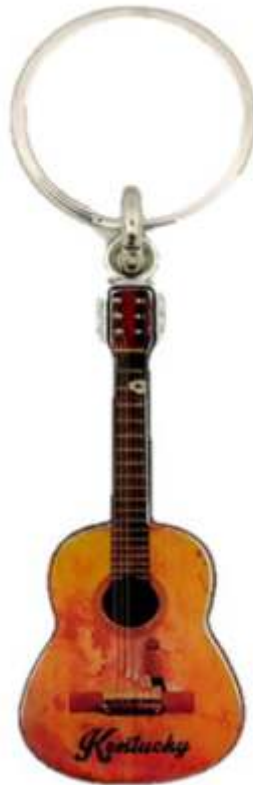
12052 Guitar Keychain