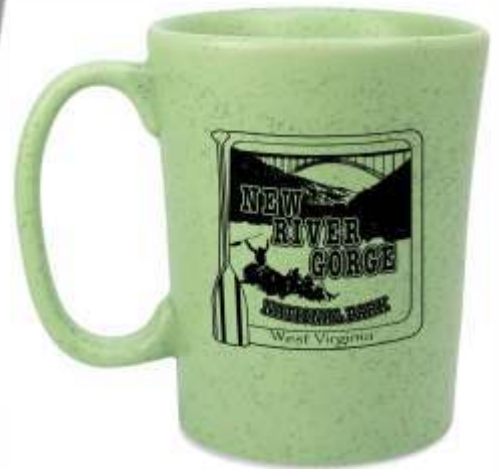
13116 New River Gorge NP Mug