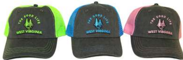
18025 The Good Life Neon Mesh Hat