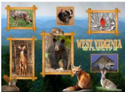
11253 Wildlife Magnet