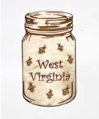
11290 Mason Jar/Fireflies Wood Magnet