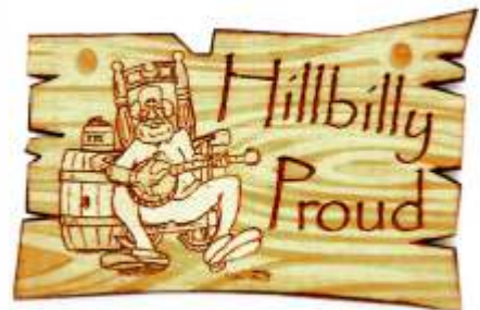
11166 Hillbilly Proud Magnet