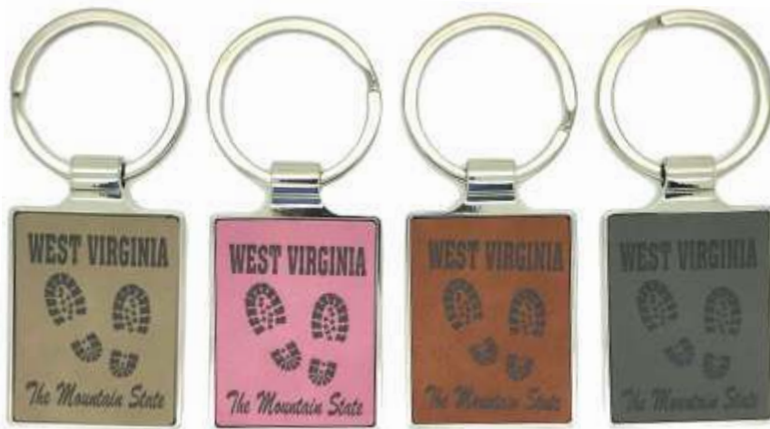
12224 Leather Footprints Keychain