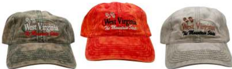
18012 Footprints Hat