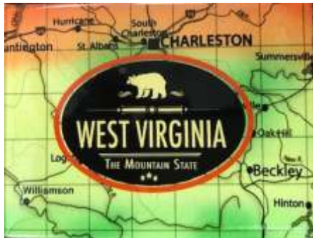
11242 Roadmap Magnet