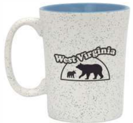
13115 Speckled Bears Mug