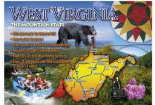
11103 Map/Facts Magnet