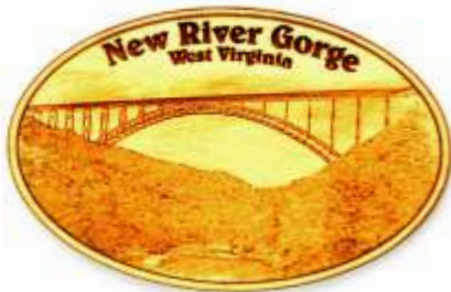
11088 NRG Magnet