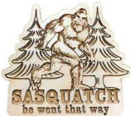
11281 Sasquatch That Way Magnet