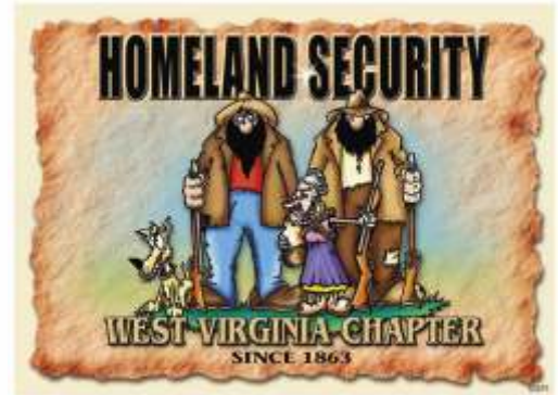
11113 Homeland Security Magnet