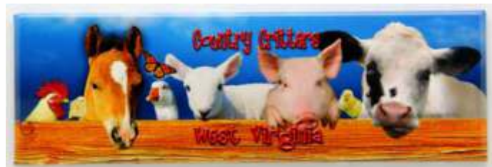
11114 Down on the Farm Magnet