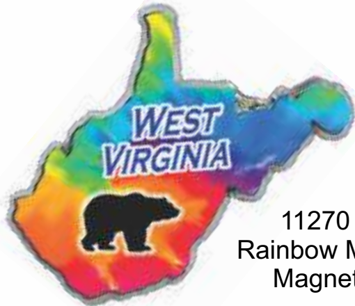
11270 Rainbow Map Magnet