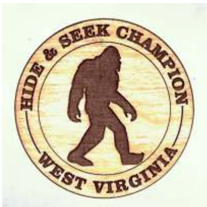
11289 Sasquatch Hide & Seek Magnet