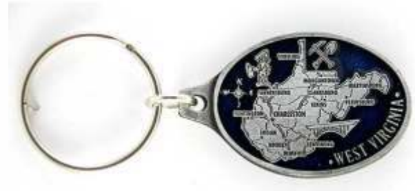
12087 Pewter Oval Keychain