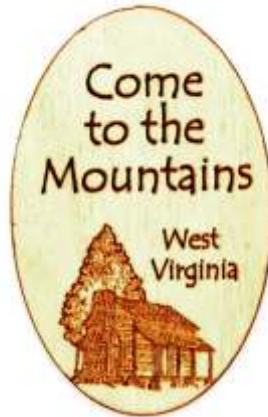
11124 Mountains Magnet