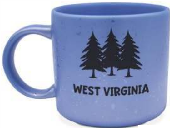
13117 Trees Mug