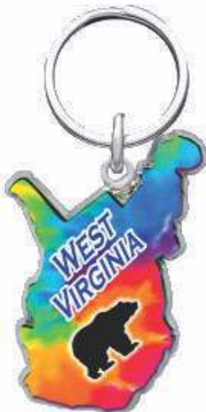
12217 Rainbow Map Keychain