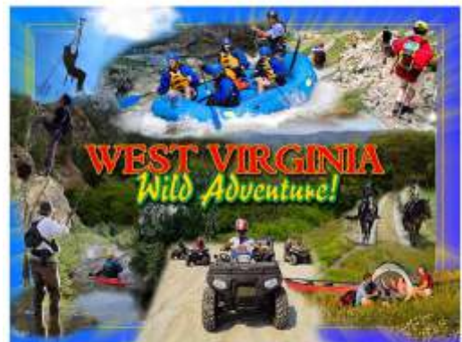
11180 Adventure Magnet