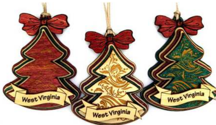
22024 Layered Tree Ornament, 3 Asst. Colors