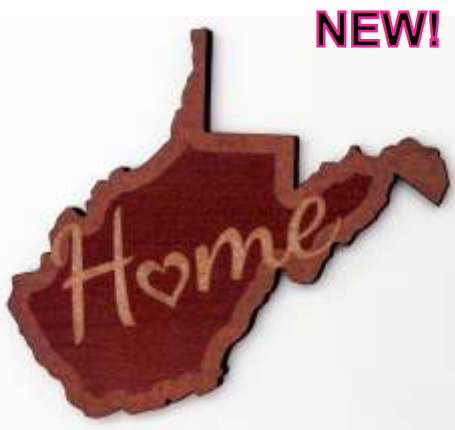
Stained Wood Home Magnet