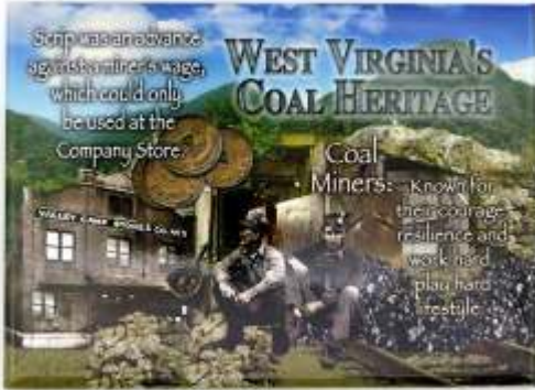
11108 Coal Miner Facts Magnet