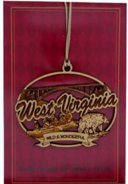
22011 Collage Ornament Packaged for Hanging