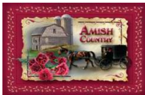
11150 Victorian Photo Magnet