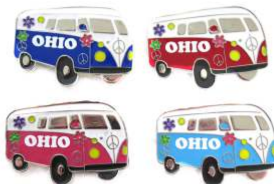
11276 Groovy Van Magnet 4 color assort