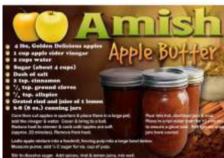
11265 Apple Butter Recipe Photo Magnet