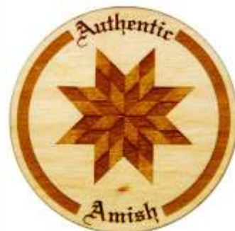
11165 Quilt Magnet