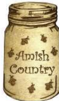
11263 Mason Jar Fireflies Magnet