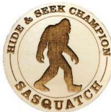
11282 Sasquatch Hide & Seek Magnet