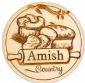
11279 Bakery Magnet