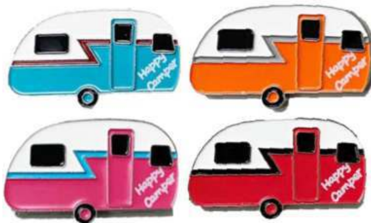
11287 Happy Camper Magnet 4 color assort