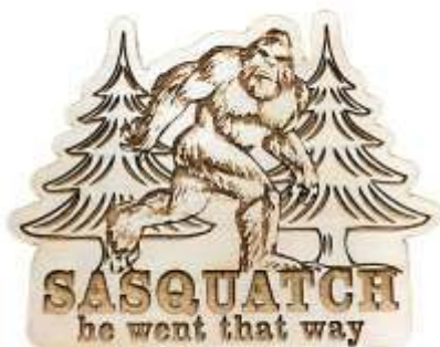
11281 Sasquatch that way magnet