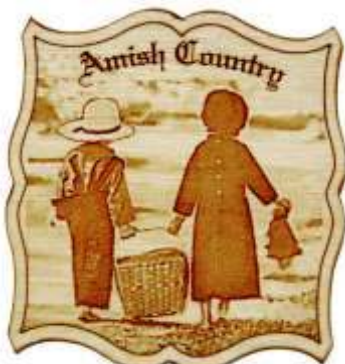
11164 Amish Kids Magnet