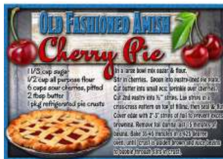
11266 Cherry Pie Recipe Photo Magnet