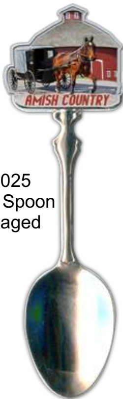
20025 Photo Spoon Packaged