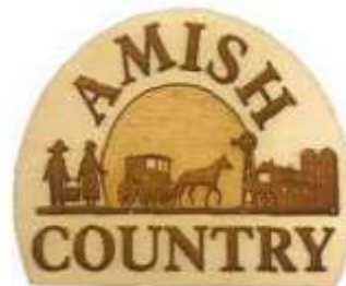
11280 Farm Scene Magnet