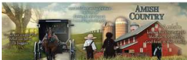
11112 Facts Photo Magnet