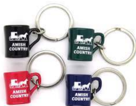
12214 Colorful cup keychain 4 color assort