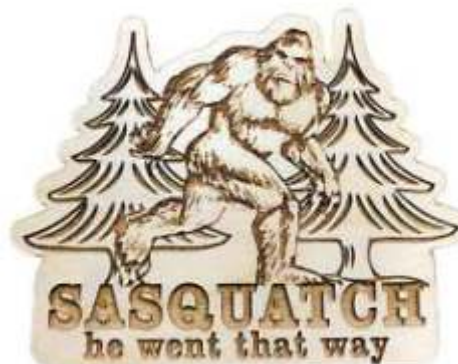
11281 Sasquatch That Way Magnet