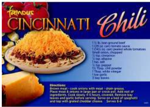
CU6655 Chili Recipe Magnet