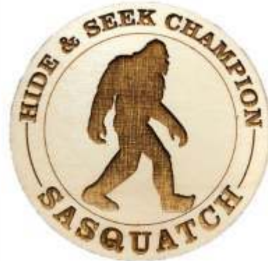
11282 Sasquatch Hide & Seek Magnet