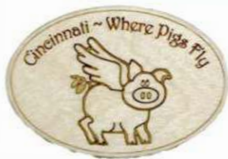
11245 Wood Pig Magnet