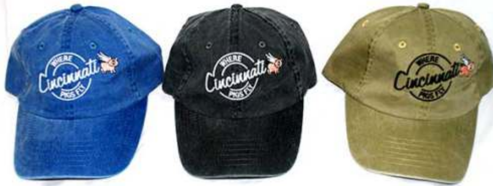
18016 Logo Hat, 3 Color assort