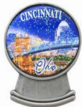
11259 Snowglobe Magnet