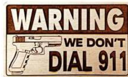
11163 911 Magnet