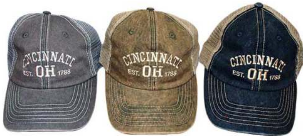
18020 Mesh Hat, 3 Color assort