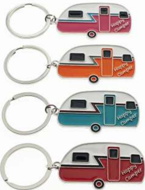
12226 Happy Camper Keychain