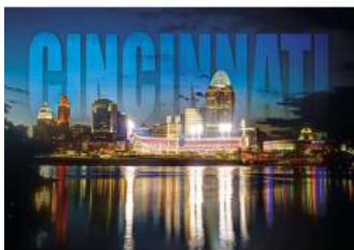
11026 Night Skyline Magnet (Option 2)