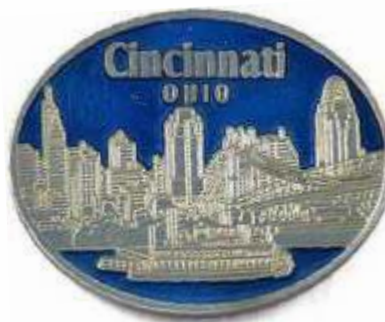
11077 Pewter Oval Magnet