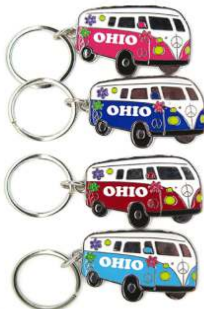
12212 Groovy Van Keychain