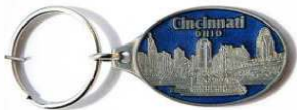
12071 Pewter Oval Keychain