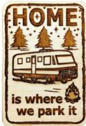
11167 Trailer Magnet