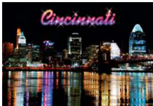
11026 Pink Skyline Magnet (Option 1)