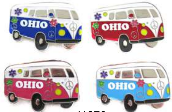
11276 Groovy Van Magnet 4 color assort