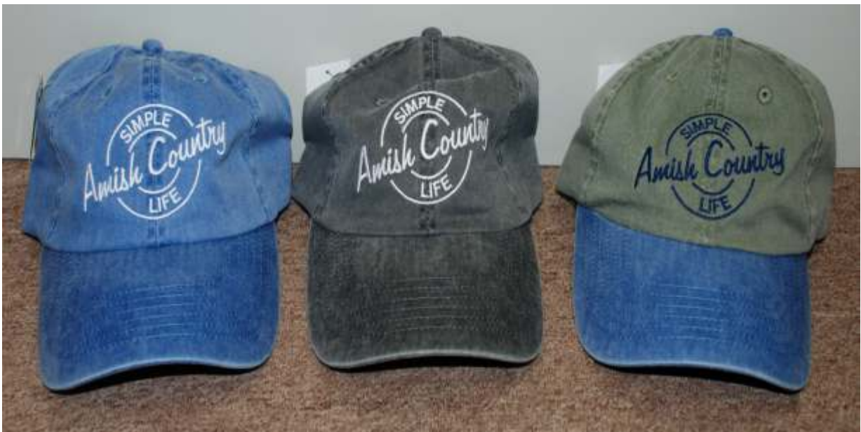
18022 Amish Country Logo Hat 3 color assort