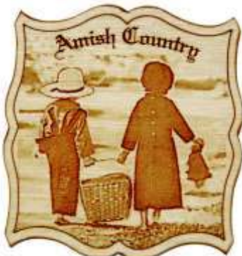
11164 Amish Kids Magnet