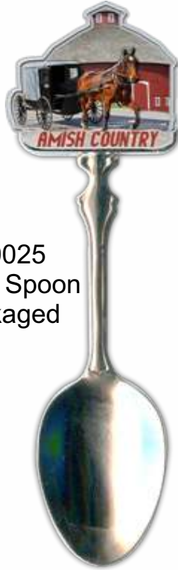
20025 Photo Spoon Packaged