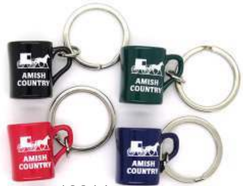
12214 Colorful cup keychain 4 color assort