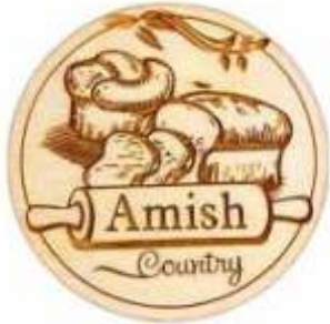
11279 Bakery Magnet