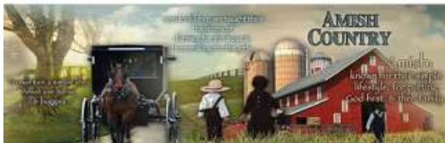
11112 Facts Photo Magnet