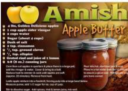
11265 Apple Butter Recipe Photo Magnet