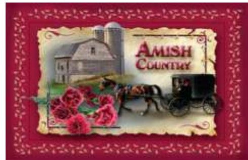
11150 Victorian Photo Magnet