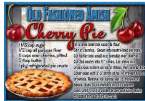
11266 Cherry Pie Recipe Photo Magnet