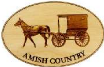
11126 Horse & Buggy Magnet