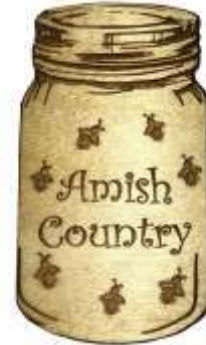
11263 Mason Jar Fireflies Magnet