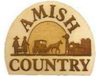
11280 Farm Scene Magnet