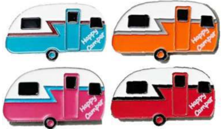
11287 Happy Camper Magnet 4 color assort