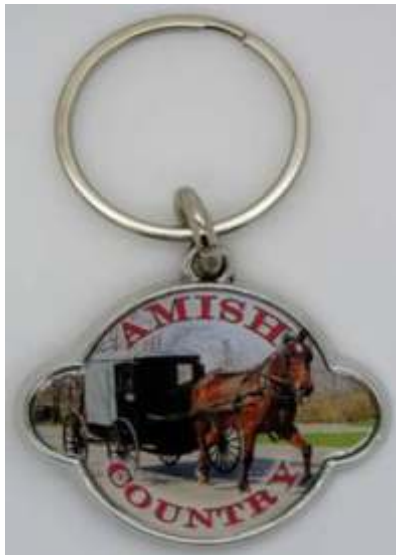
12116 Photo horse & buggy keychain