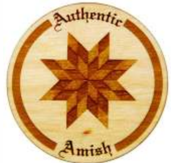
11165 Quilt Magnet