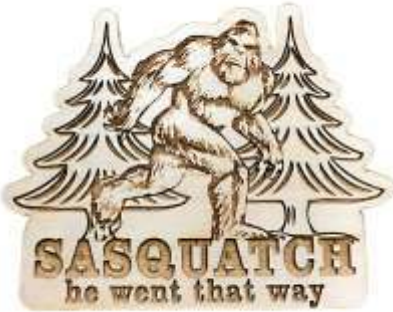
11281 Sasquatch that way magnet