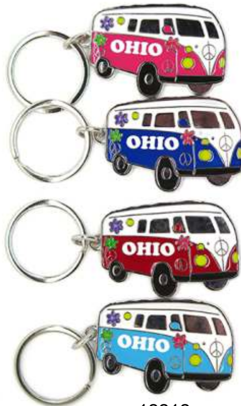
12212 Groovy Van Keychain 4 color assort