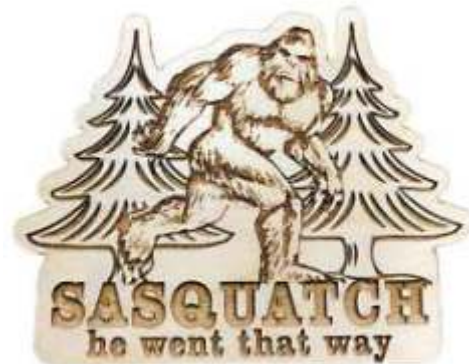
11281 Sasquatch That Way Magnet