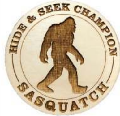
11282 Sasquatch Hide & Seek Magnet