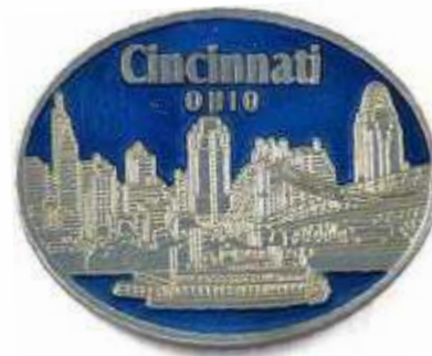
11077 Pewter Oval Magnet