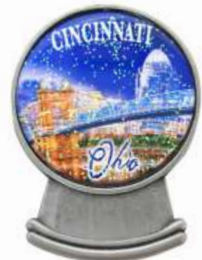
11259 Snowglobe Magnet