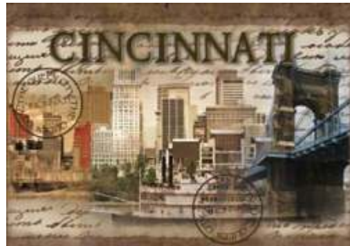
F3360 Postage Magnet