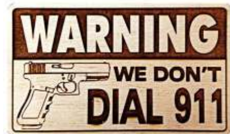
11163 911 Magnet