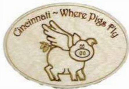
11245 Wood Pig Magnet