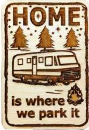
11167 Trailer Magnet