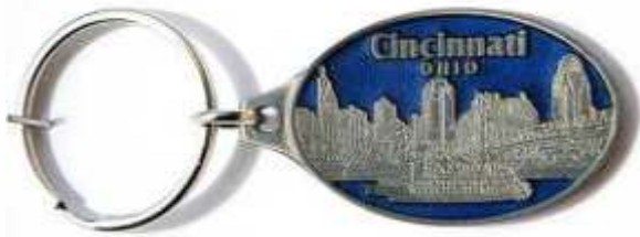
12071 Pewter Oval Keychain