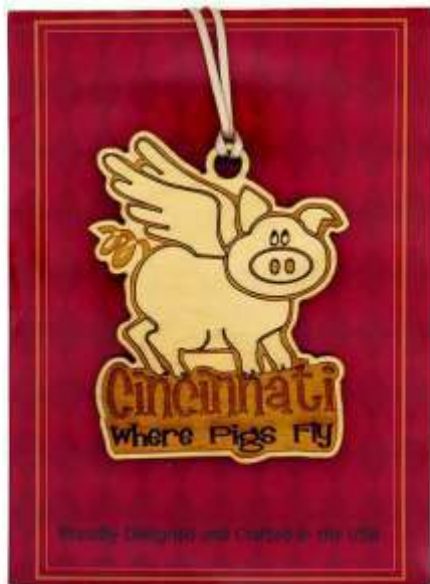
22004 Flying Pig Ornament