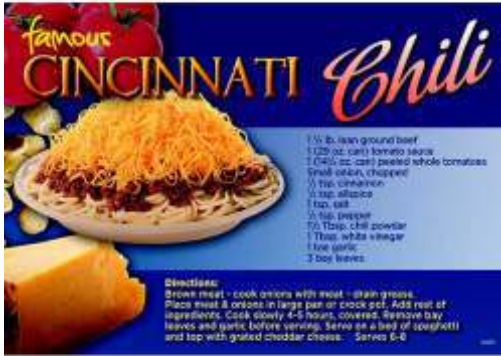
CU6655 Chili Recipe Magnet