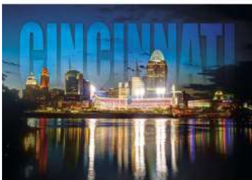
11026 Night Skyline Magnet (Option 2)