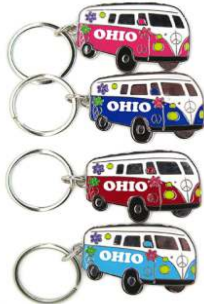
12212 Groovy Van Keychain