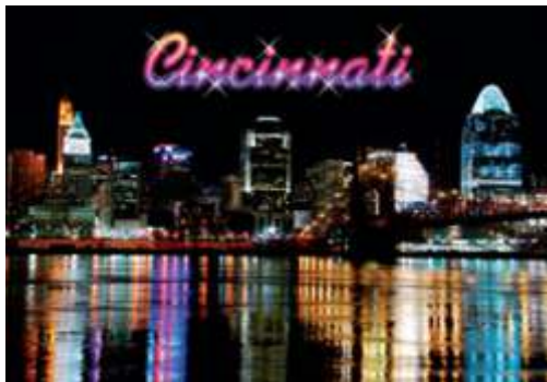
11026 Pink Skyline Magnet (Option 1)