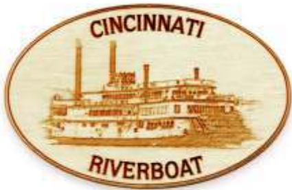
11125 Riverboat Magnet