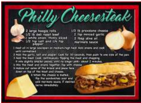
11210 Philly Cheesesteak Magnet