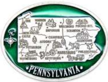
11157 Pewter Oval Magnet