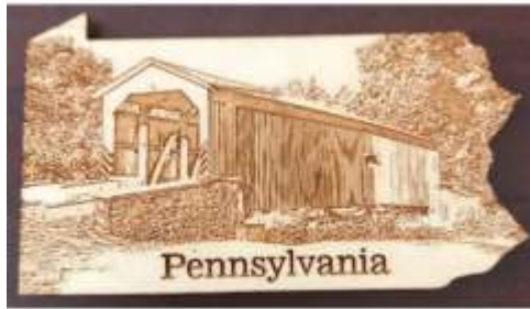
11168 Covered Bridge Map Magnet