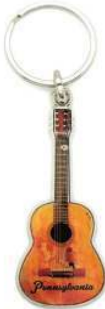
12148 Guitar Keychain