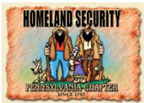
11154 Homeland Security Magnet