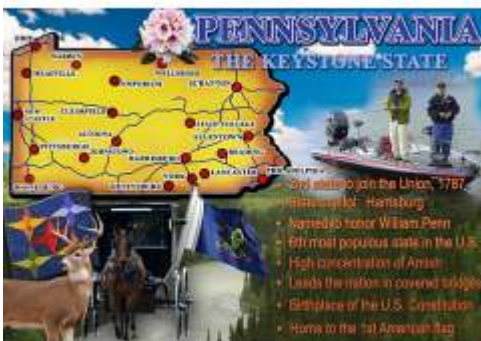
11155 Map Facts Magnet