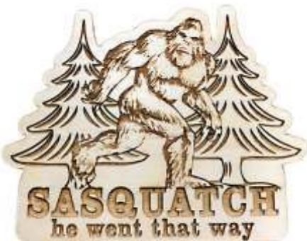
11281 Sasquatch That Way Magnet