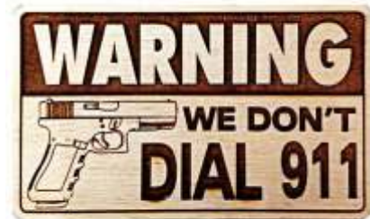
11163 911 Magnet