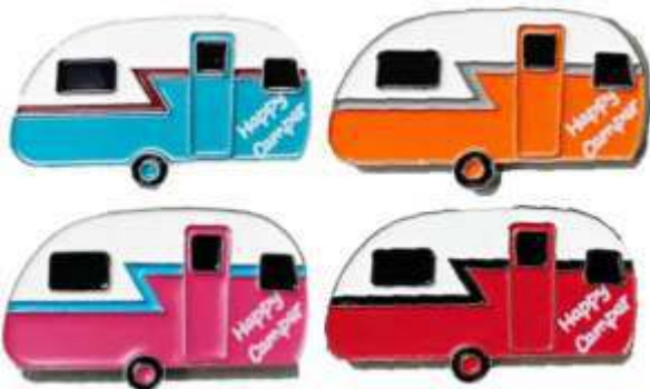
11287 Happy Camper Magnet