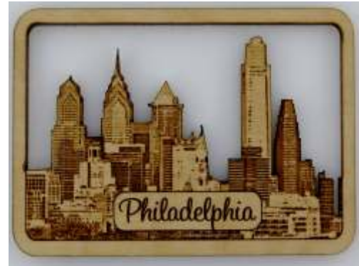
11208 Philly Skyline Magnet