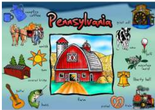
11152 Icons Magnet