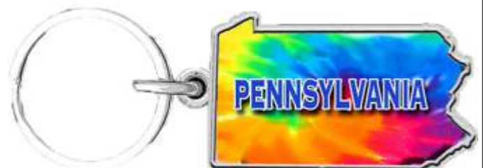
12130 Rainbow Map Keychain