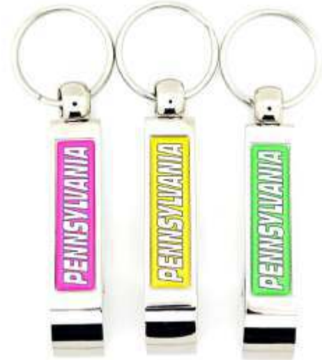
12108 Neon Bottle Opener Keychain 3 Color Asst.