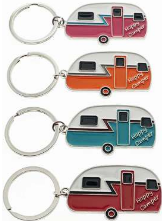
12226 Happy Camper Keychain