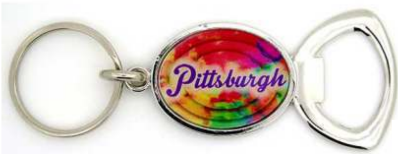
12182 Pittsburgh Tie-Dye Opener Keychain