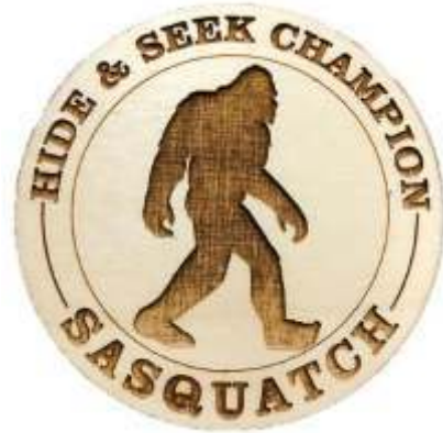
11282 Sasquatch Hide & Seek Magnet