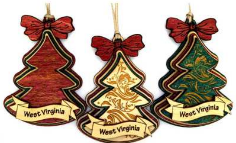
22024 Tree Ornament, 3 Asst. Colors