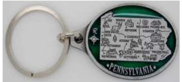
12140 Pewter Oval Map Keychain