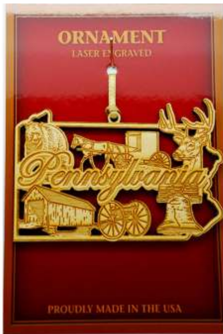
22021 Collage Ornament