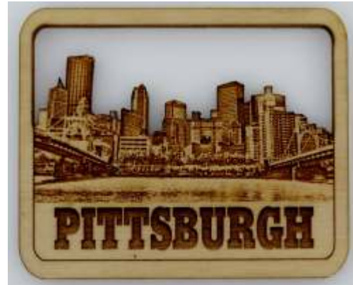
11178 Pittsburgh Skyline Magnet