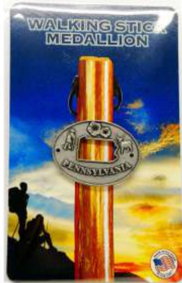
20028 Walking Stick Medallion