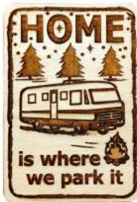
11167 Trailer Magnet