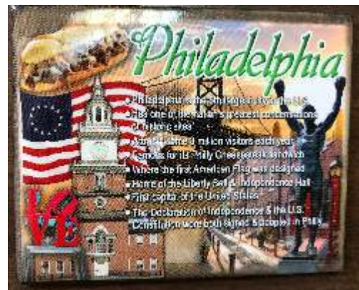
11209 Philly Facts Magnet