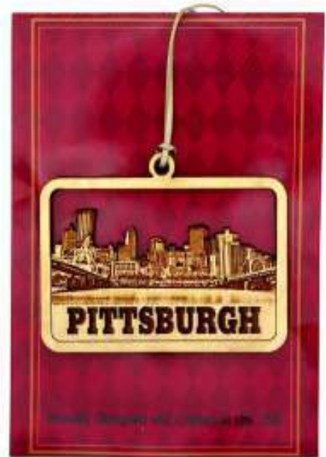
22022 Pittsburgh Skyline Ornament