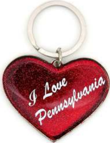
12113 Heart Keychain