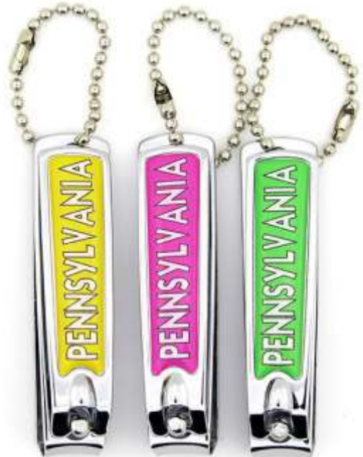
12106 Nail Clipper Keychain 3-color assort