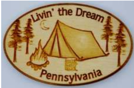
11156 Camping Magnet