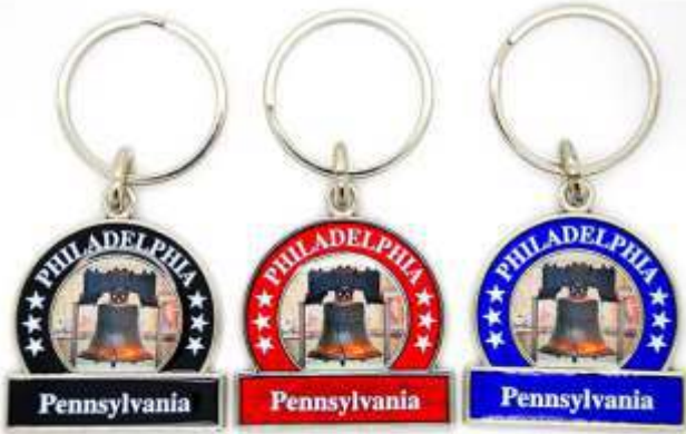
12125 Philly Liberty Bell Keychain 3 Asst. Colors