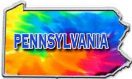
11145 Rainbow Map Magnet