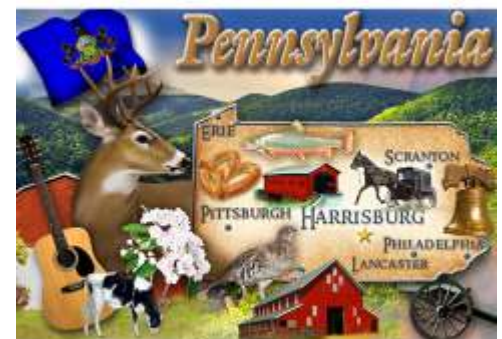
11177 Map Collage Magnet