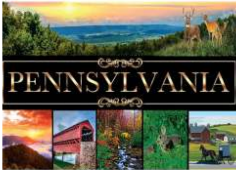
11149 Black Classics Magnet