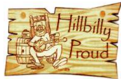
11166 Hillbilly Proud Magnet